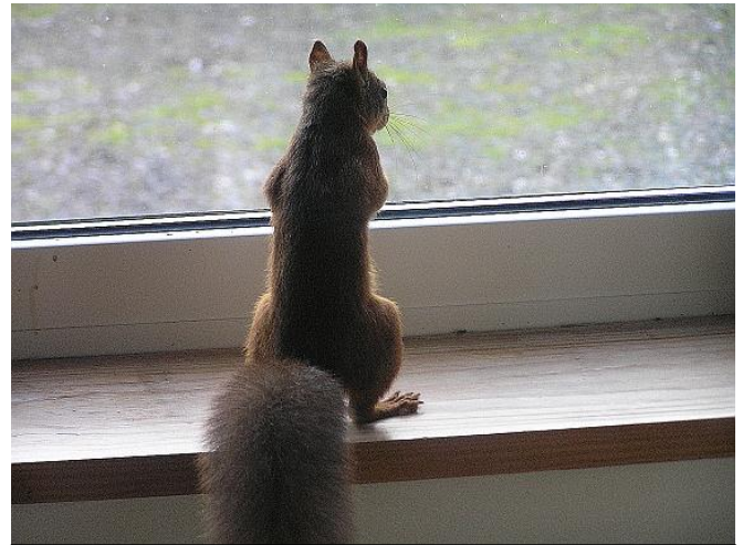
Rain, rain go away! at Middle Paradise, Garsdale