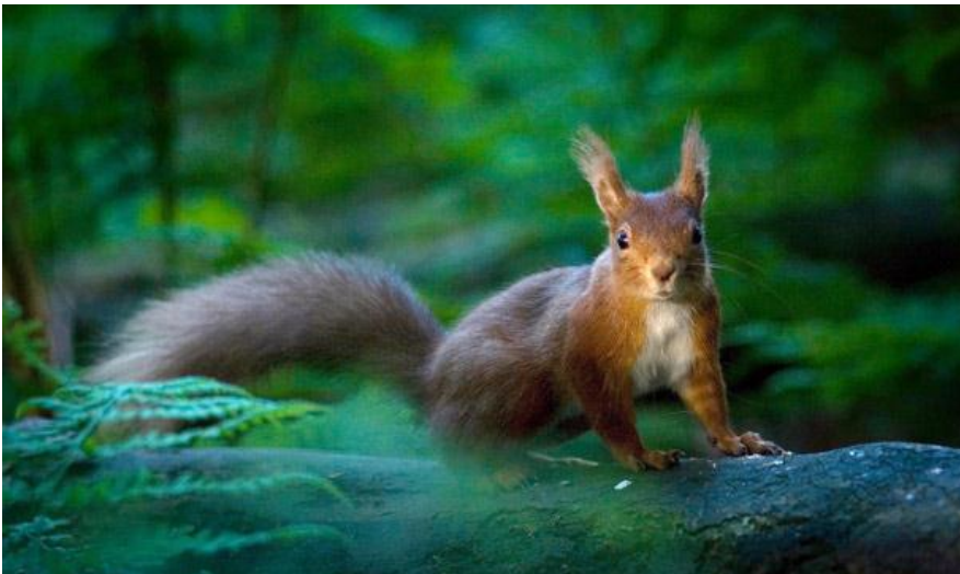
Will Nichol's winning picture

Will won a three-day wildlife photography break and a camera kit.