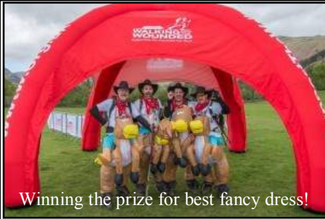
Winning the prize for best fancy dress!

This May the P&DRSG were once again invited via Distant Horizons Outdoor Adventure Company (Watermillock), to support the Walking with the Wounded (WWTW) charitable event which is held annually at the sports ground in Grasmere.