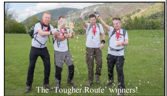
The 'Tougher Route' winners!