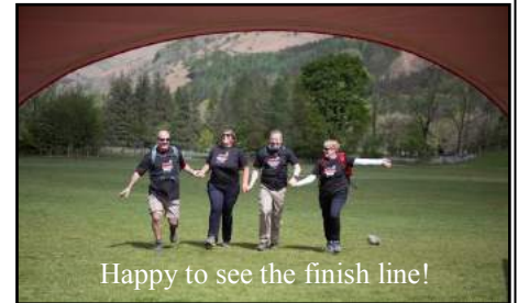
Happy to see the finish line!