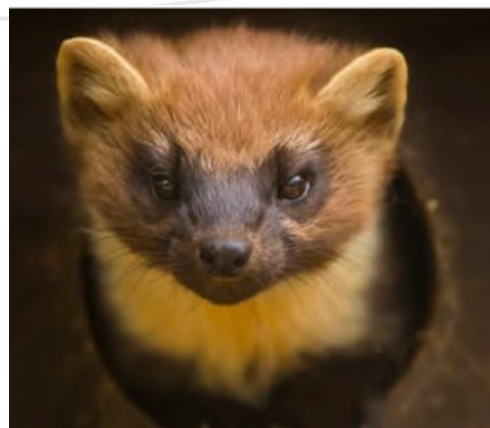
The Pine Marten... Friend or Foe??

For the full article please visit https://theconversation.com/why-the-pine-marten-is-not-every-red-squirrels-best-friend-110209